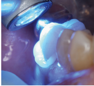
3-second tack cure