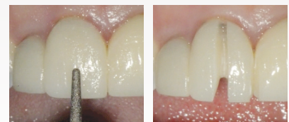
770.8 Round-End Taper Section & Remove

ZX Featuring LTech™ Proprietary Technology, this bur is designed for fast, efficient zirconia removal, reducing chair time and improving the experience for both patient and dentist.